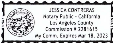
Place Notary Seal and/or Stamp Above