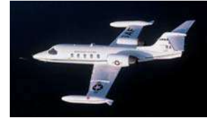
Lear 35/C-21 Activity: Transient Personnel Transport Speed: 110 - 200 kts