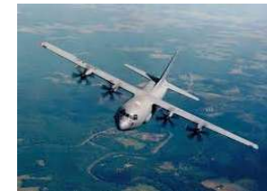
Lockheed C-130 Activity: Transient Pattern Work Speed: 110 - 200 kts