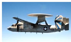
Grumman E-2C Activity: Transient Pattern Work Altitude: 1,900 MSL Speed: 110 kts