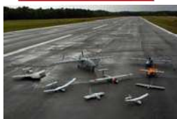
General Aviation Aircraft Activity: Pipeline Surveys, etc. Altitude: Surface-400 AGL Speed: 0-87 kts