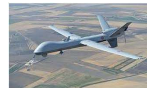
MQ-9 Activity: Transient Pattern Work Speed: 110 - 220 kts