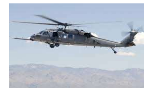
HH-60 Activity: Transient Pattern Transport Speed: 110 - 200 kts