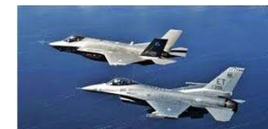
Fighter Aircraft Activity: Transient Pattern Work Speed: 110 - 200 kts