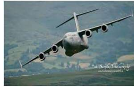
Boeing C-17 Activity: Transient Heavy Lift Speed: 130 - 200 kts