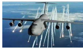
Lockheed C-5 Activity: Transient Heavy Lift Speed: 120 - 200 kts