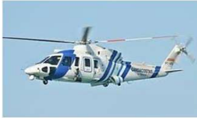
Sikorsky S-76 Activity: Offshore Platform, EMS Altitude: SFC-2000'AGL, Speed: 120 kts