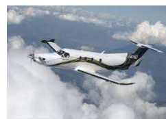
Pilatus PC-12 Activity: Locally Assigned Aircraft Altitude: Surface to 10,000 Speed: 140 Knots