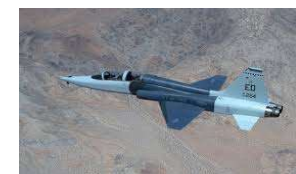
Talon T-38 Activity: Transient Pattern Work Altitude: 2,400 feet Speed: 190-250 Knots